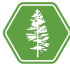
Minnesota Center for Environmental Advocacy