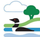
Minnesota Environmental Partnership